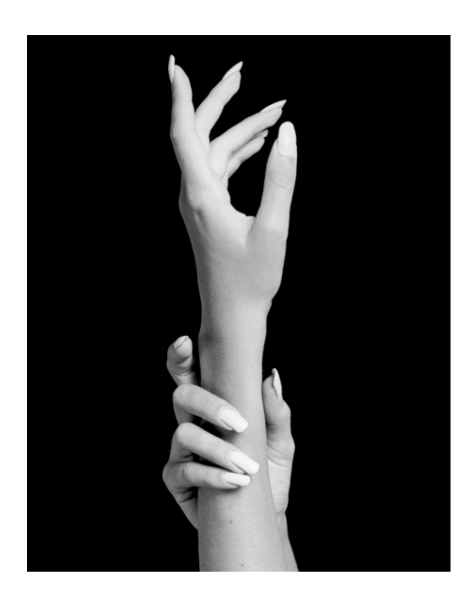
Hands 1981 Silver gelatin print 35 x 28 cm