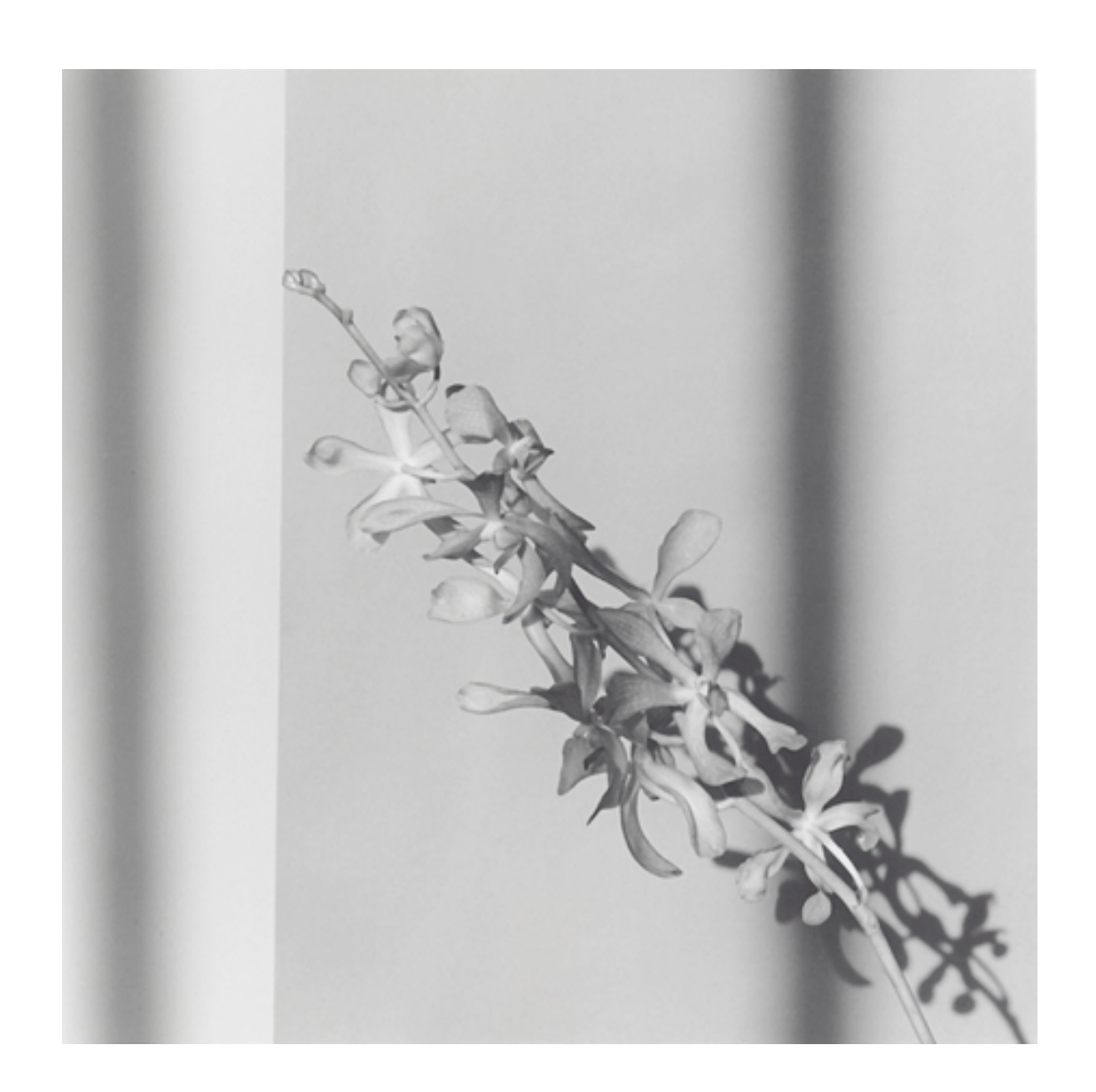
Orchids 1980 Silver gelatin print 35 x 35 cm