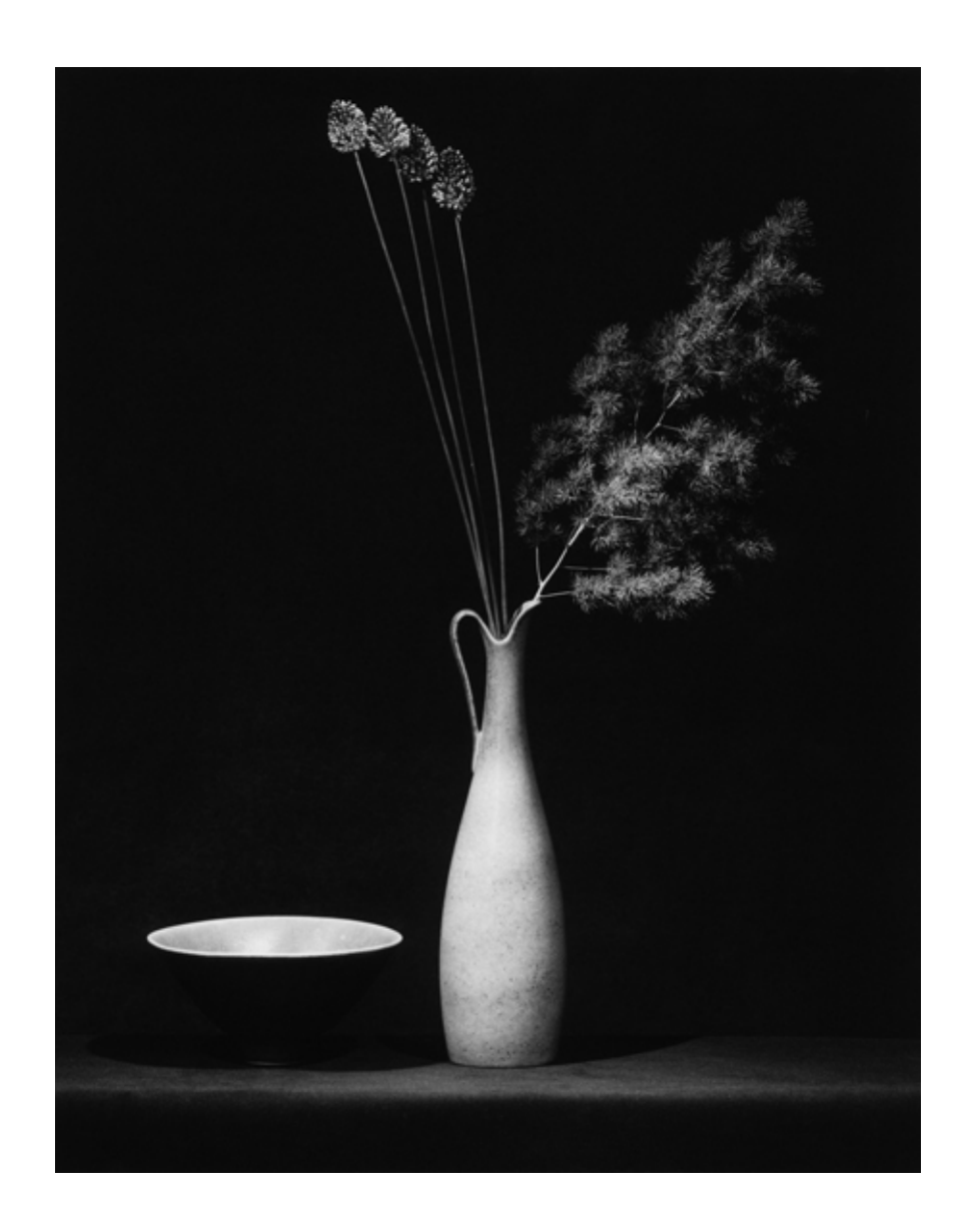
Flower 1983 Silver gelatin print 38 x 38 cm