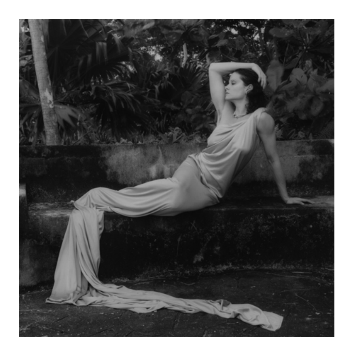
Lisa Lyon 1982 Silver gelatin print 38,5 x 38,5 cm