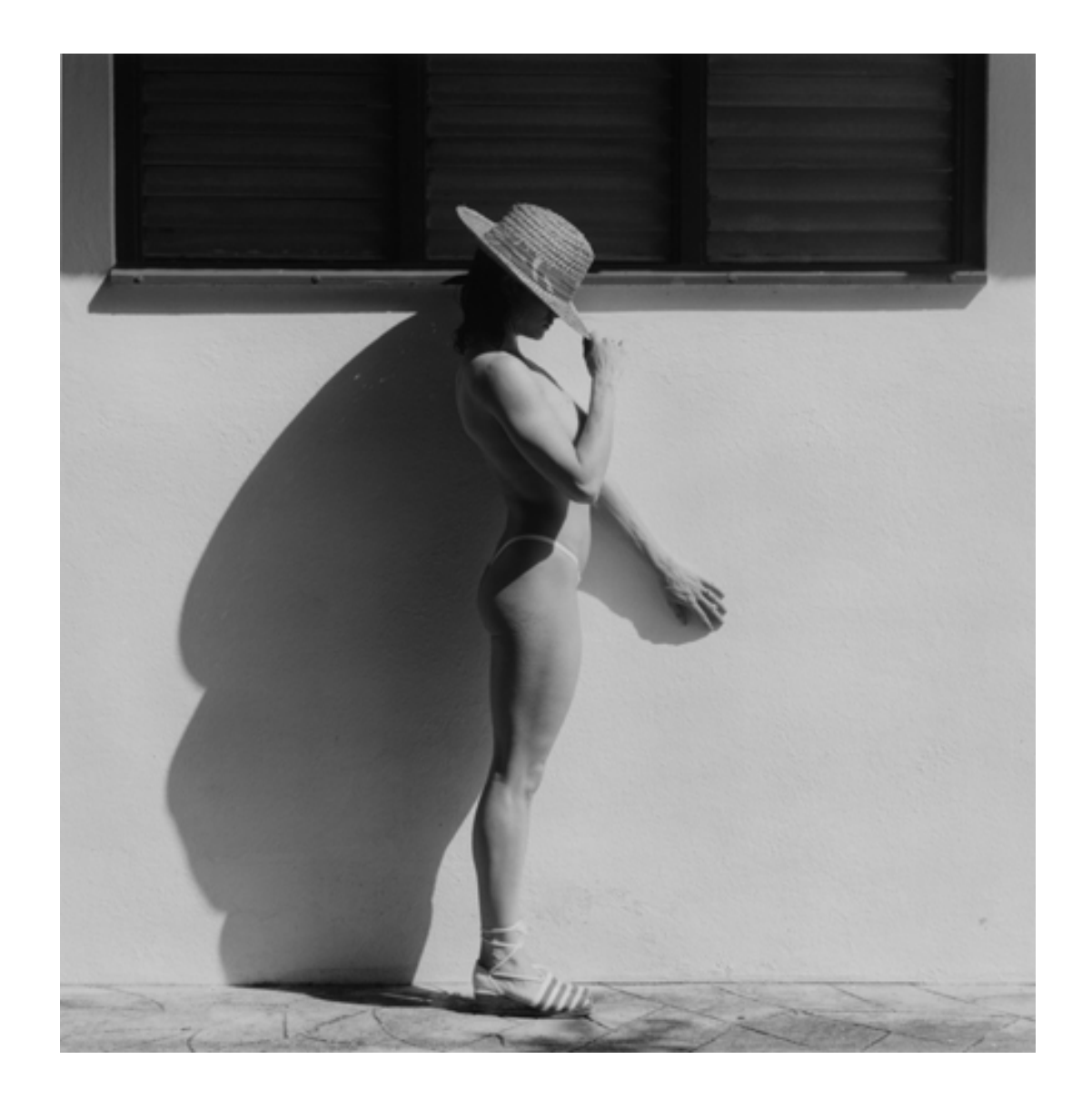
Lisa Lyon 1982 Silver gelatin print 38,5 x 38,5 cm