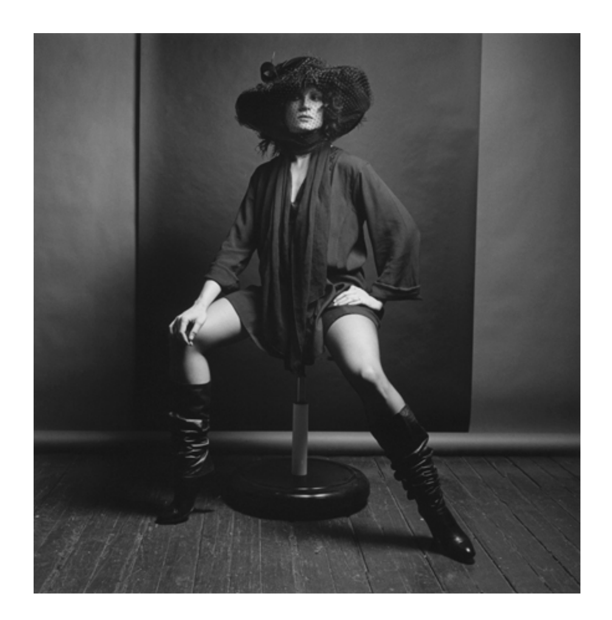
Lisa Lyon 1980 Silver gelatin print 35 x 35 cm