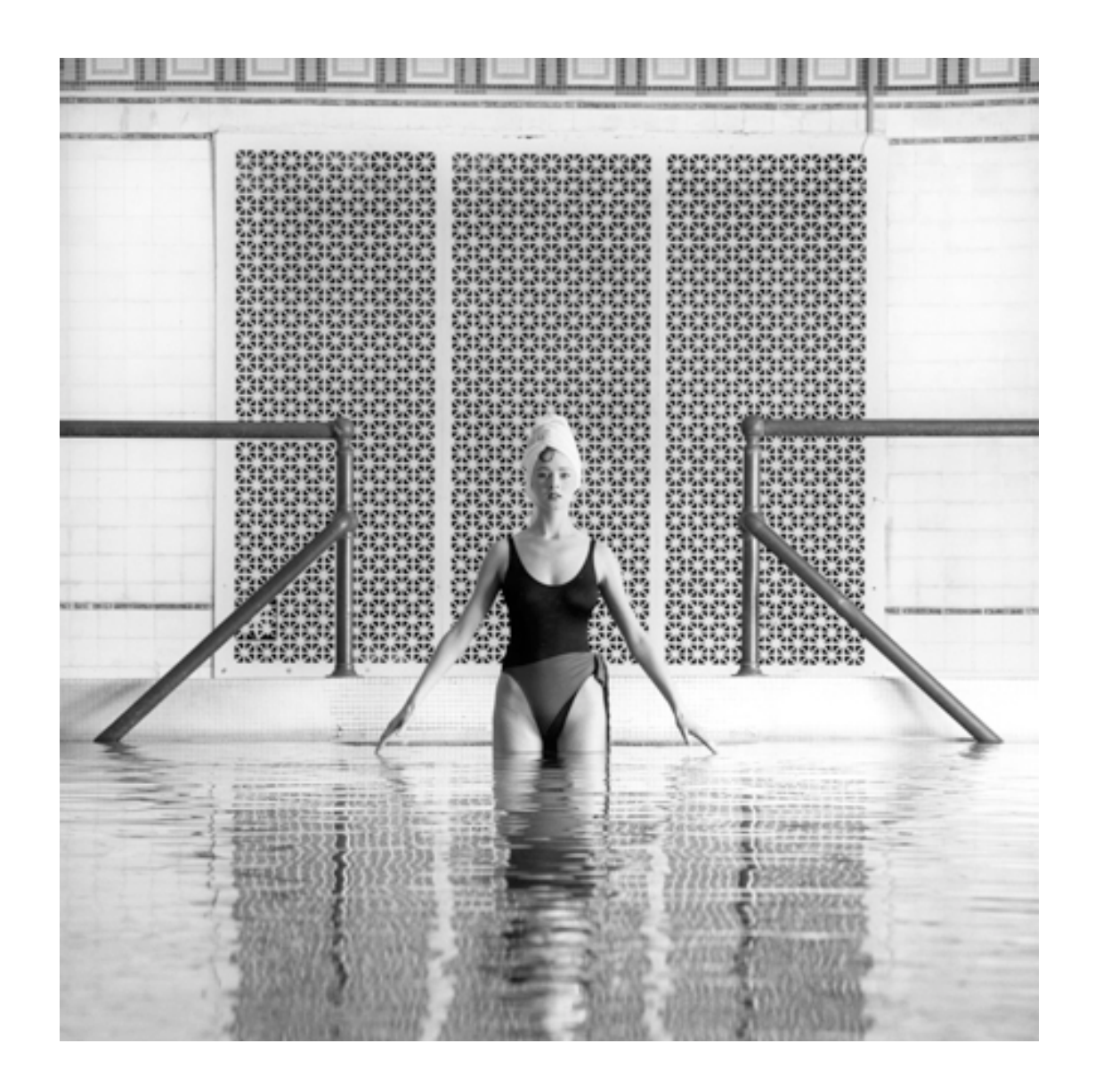
Italian Vogue 1984 Silver gelatin print 38 x 38 cm