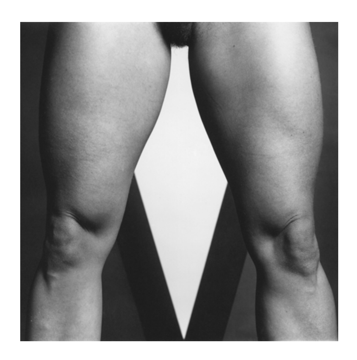
Lisa Lyon 1980 Silver gelatin print 35 x 35,5 cm