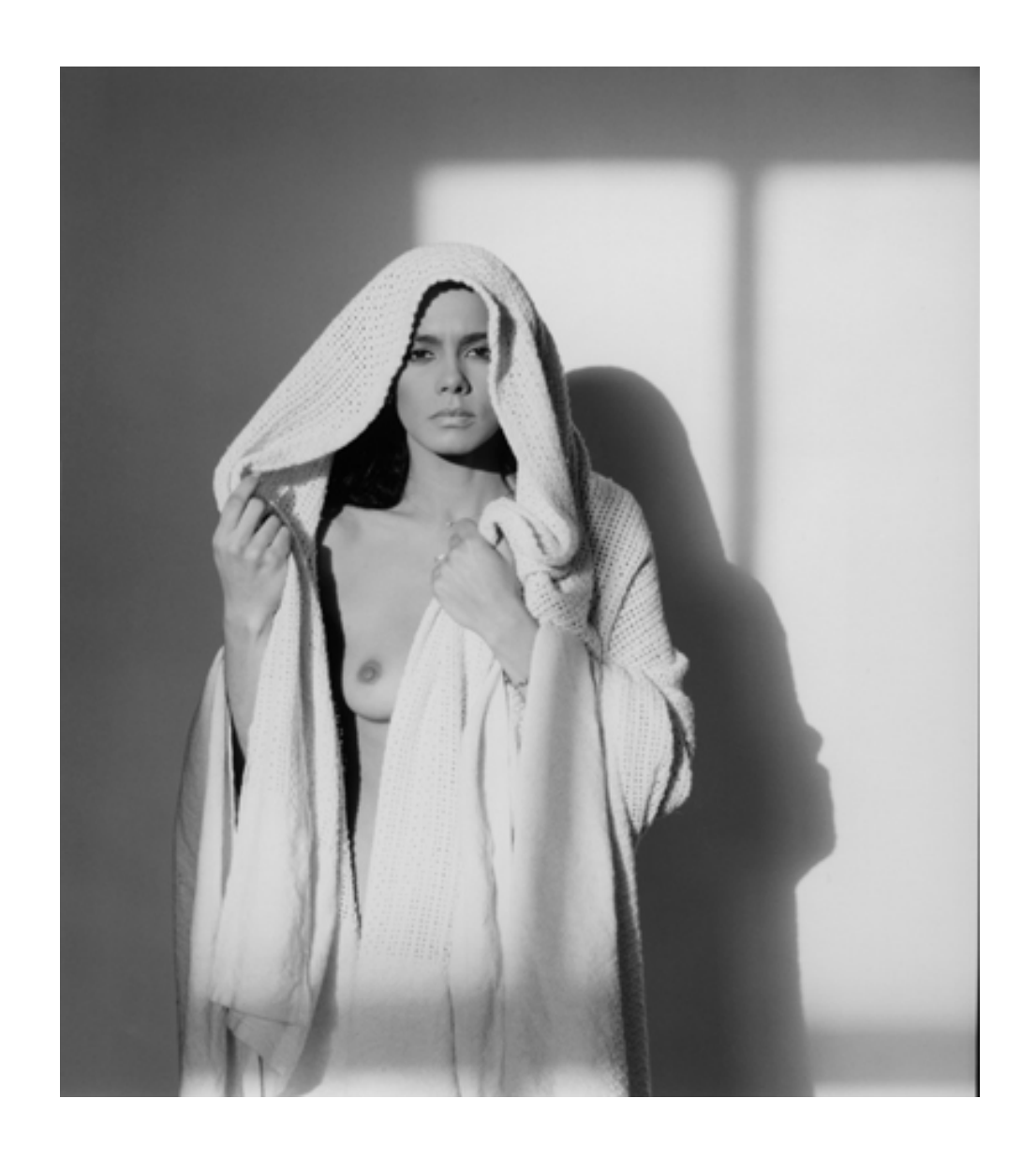
Maybelle 1982 Silver gelatin print 48,5 x 38,5 cm