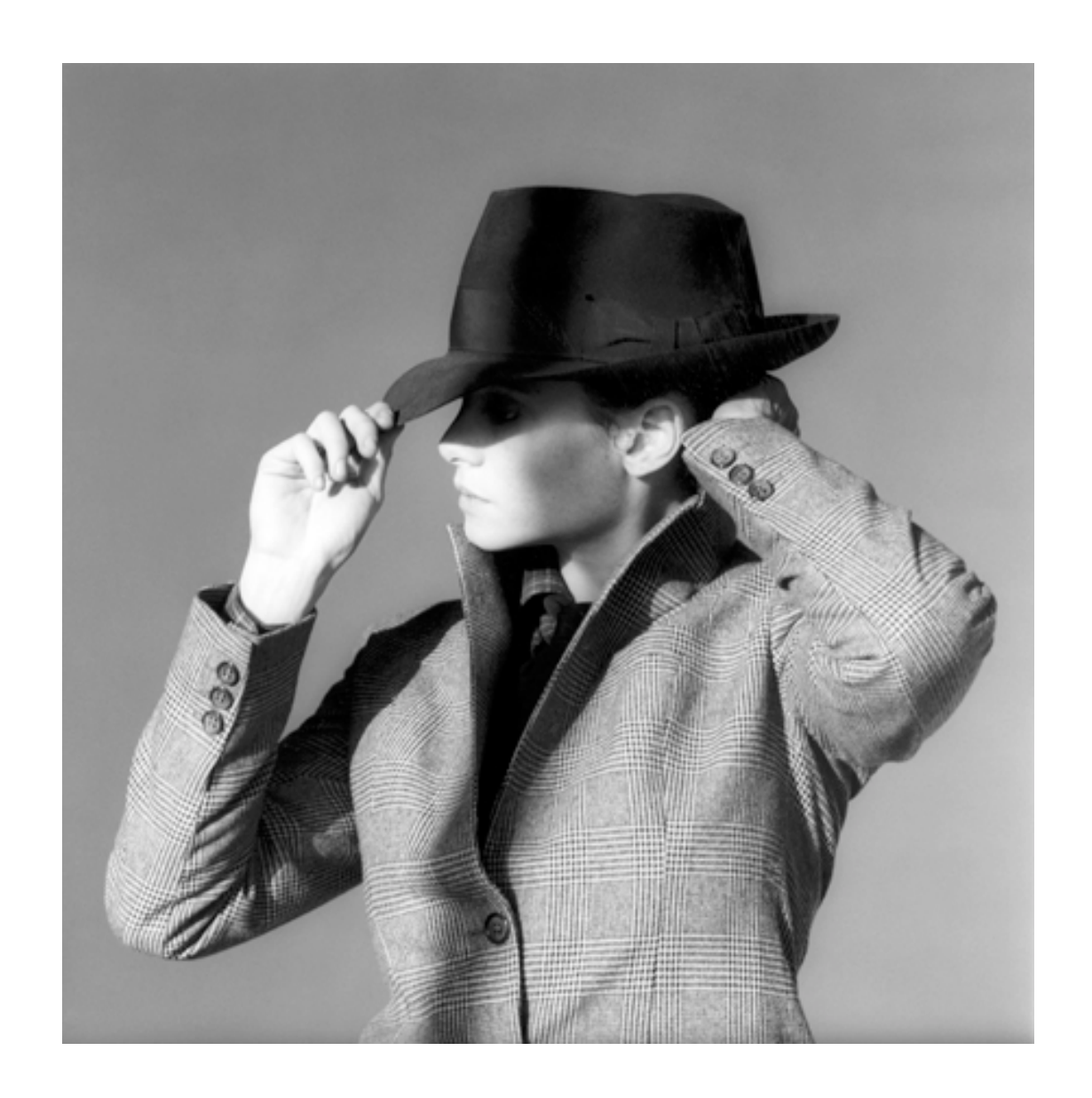
Lisa Lyon 1981 Silver gelatin print 38,5 x 38,5 cm