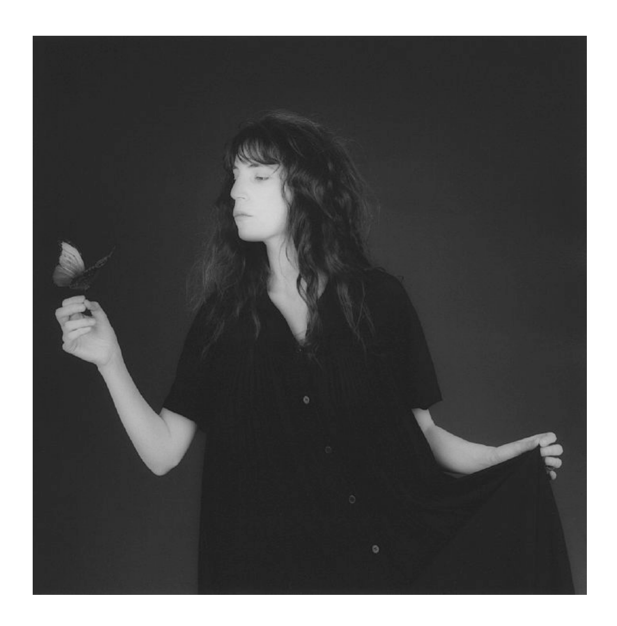
Patty Smith 1987 Silver gelatin print 51 x 61 cm