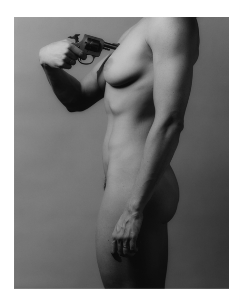
Lisa Lyon 1982 Silver gelatin print 48,5 x 38,5 cm