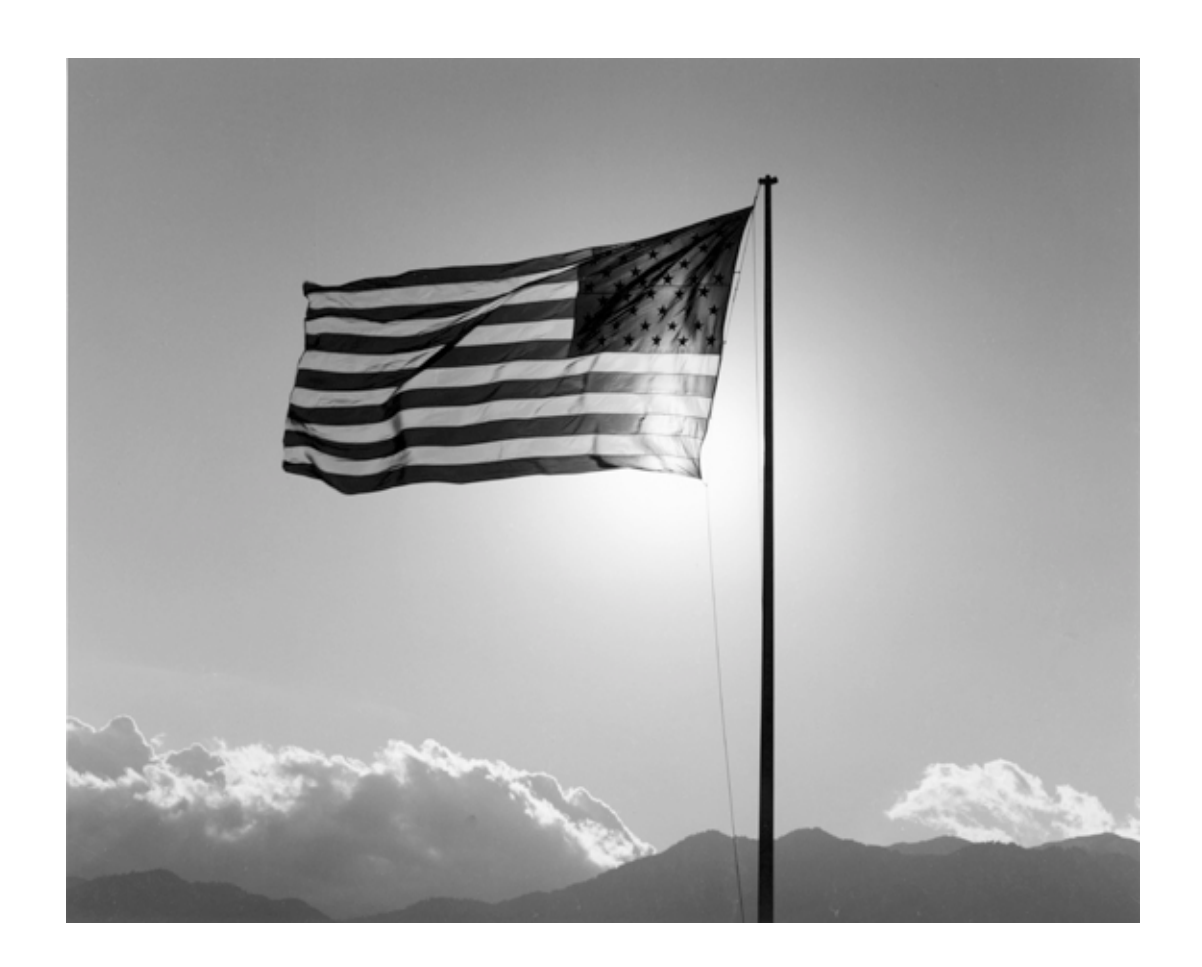
American Flag 1977 Silver gelatin print 48 x 58 cm