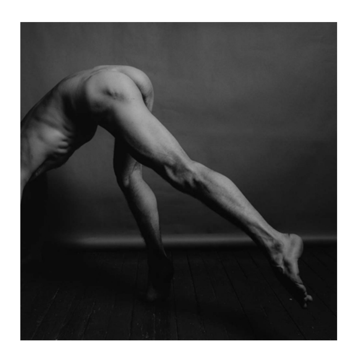
Philip 1979 Silver gelatin print 35 x 35 cm