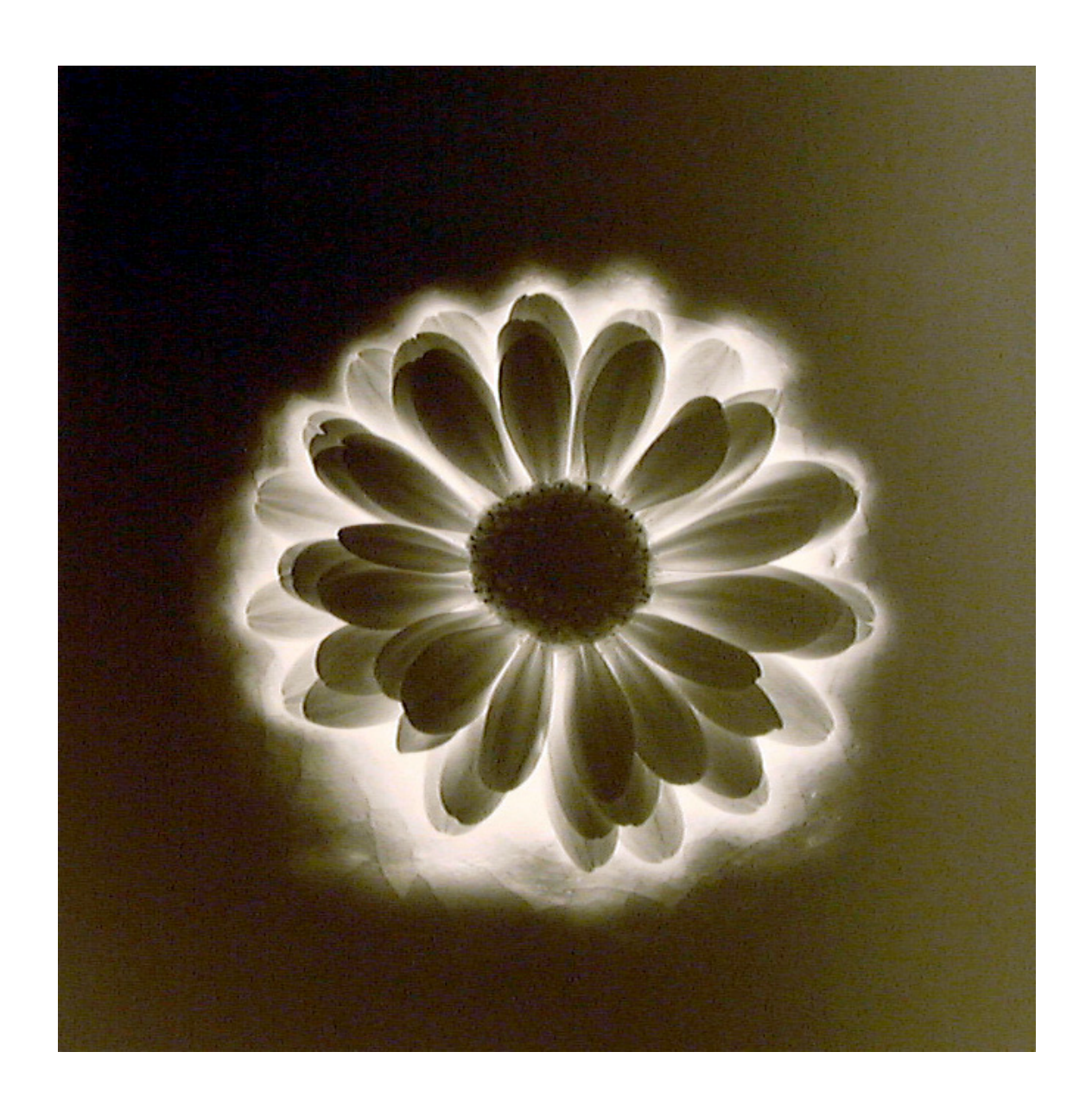
Margarita 1985 Silver gelatin print 50 x 40 cm