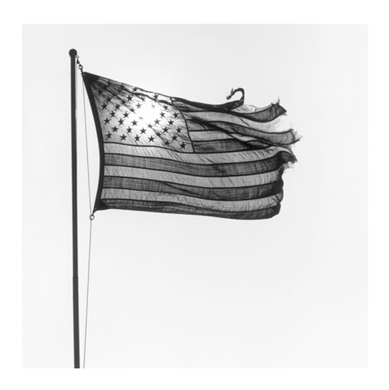
American Flag 1977 Silver gelatin print 35 x 35 cm