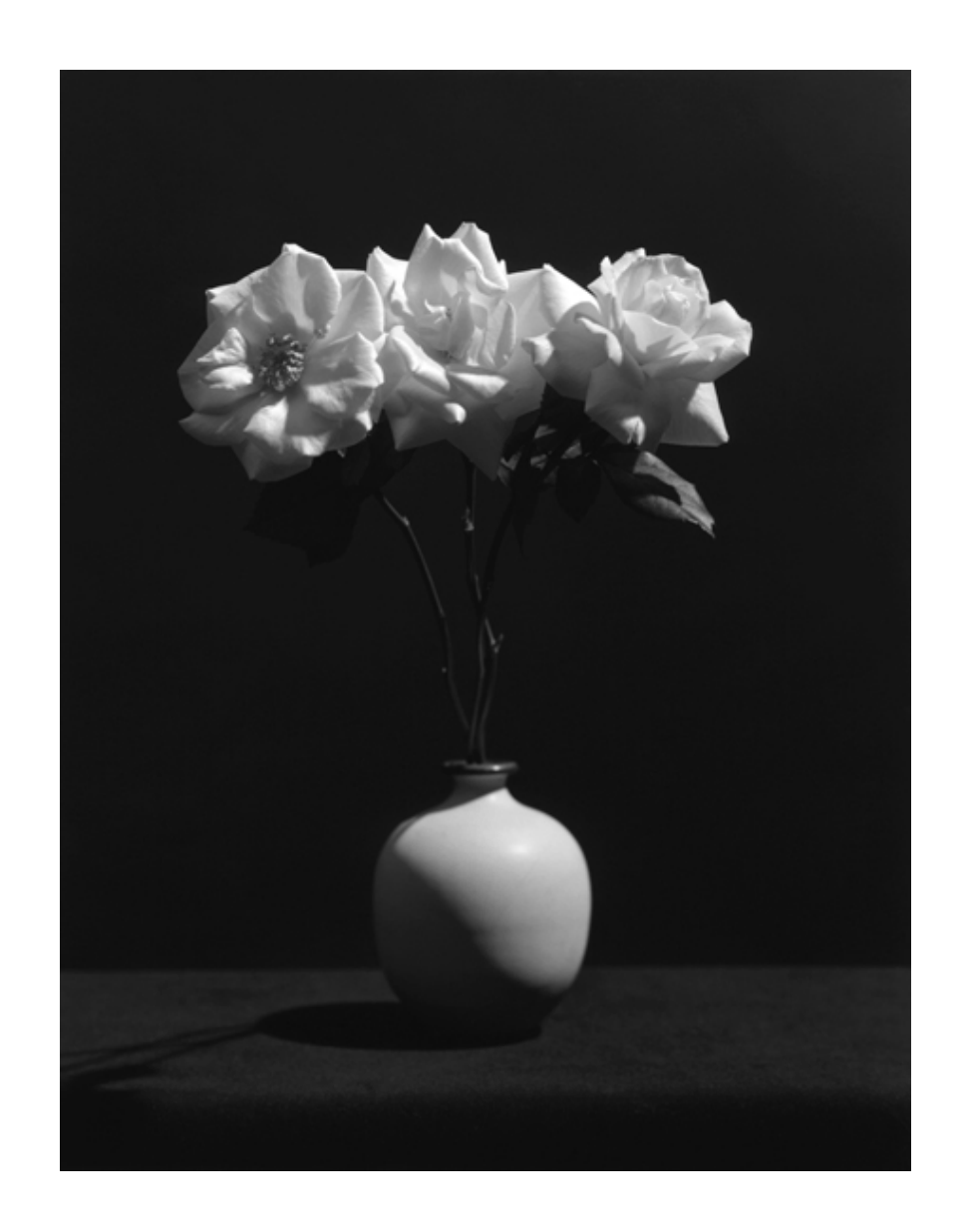
Rose 1983 Silver gelatin print 48 x 38 cm